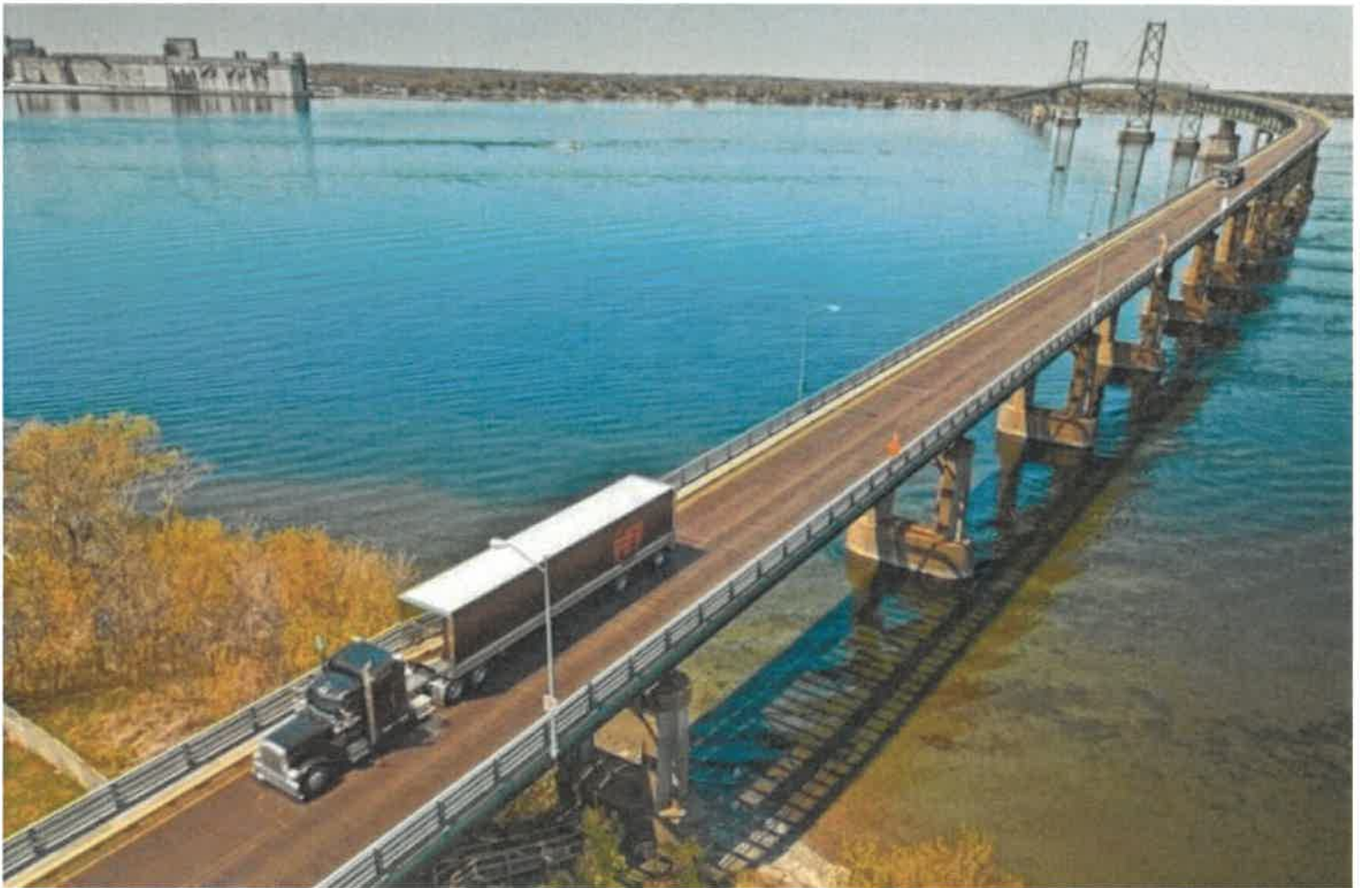
The U.S. approach to the Ogdensburg-Prescott International Bridge.

OGDENSBURG — Ogdensburg Bridge and Port Authority officials say a smartphone app required to enter Canada may be discouraging cross-border travel.