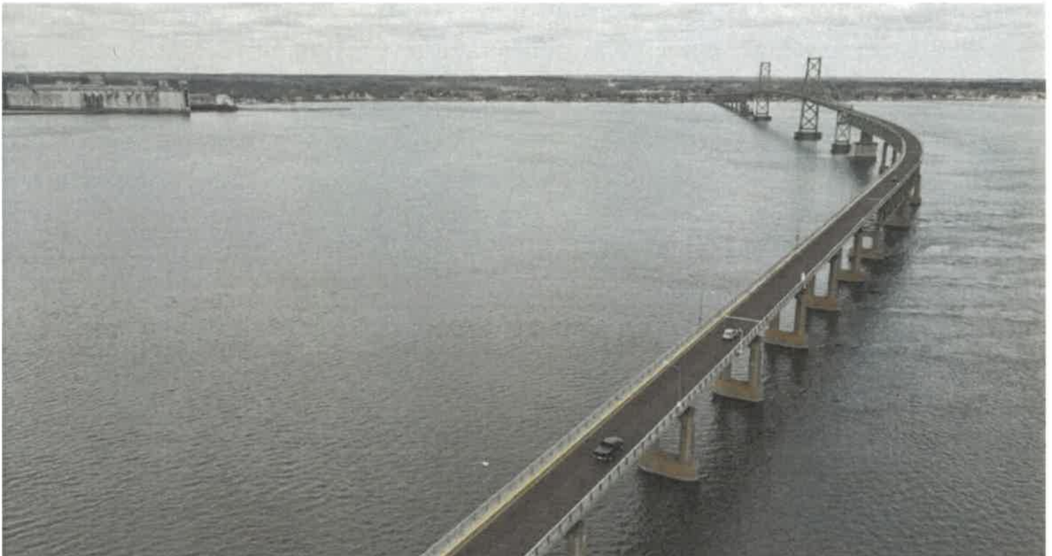
The Ogdensburg-Prescott International Bridge.

OGDENSBURG — The Ogdensburg Bridge and Port Authority will seek a federal Bridge Improvement Program grant that would pay for much of the $100 million worth of repairs and maintenance needed for the Ogdensburg-Prescott International Bridge.